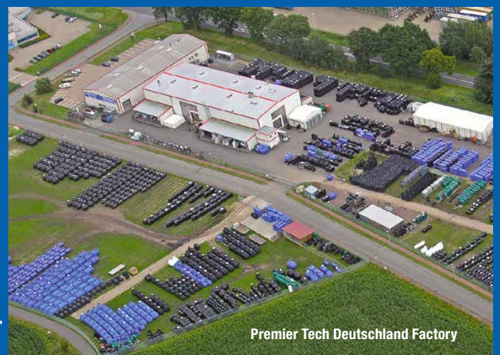
Premier Tech Deutschland Factory